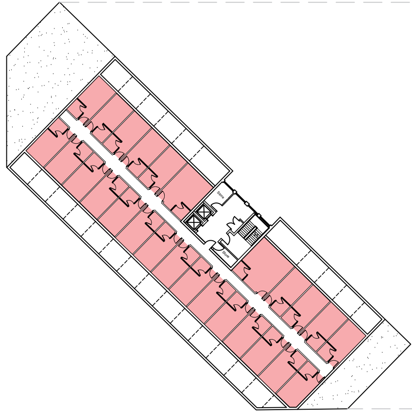
Hotel Layout 1:500 Interchangeable with first/second floor residential accommodation.