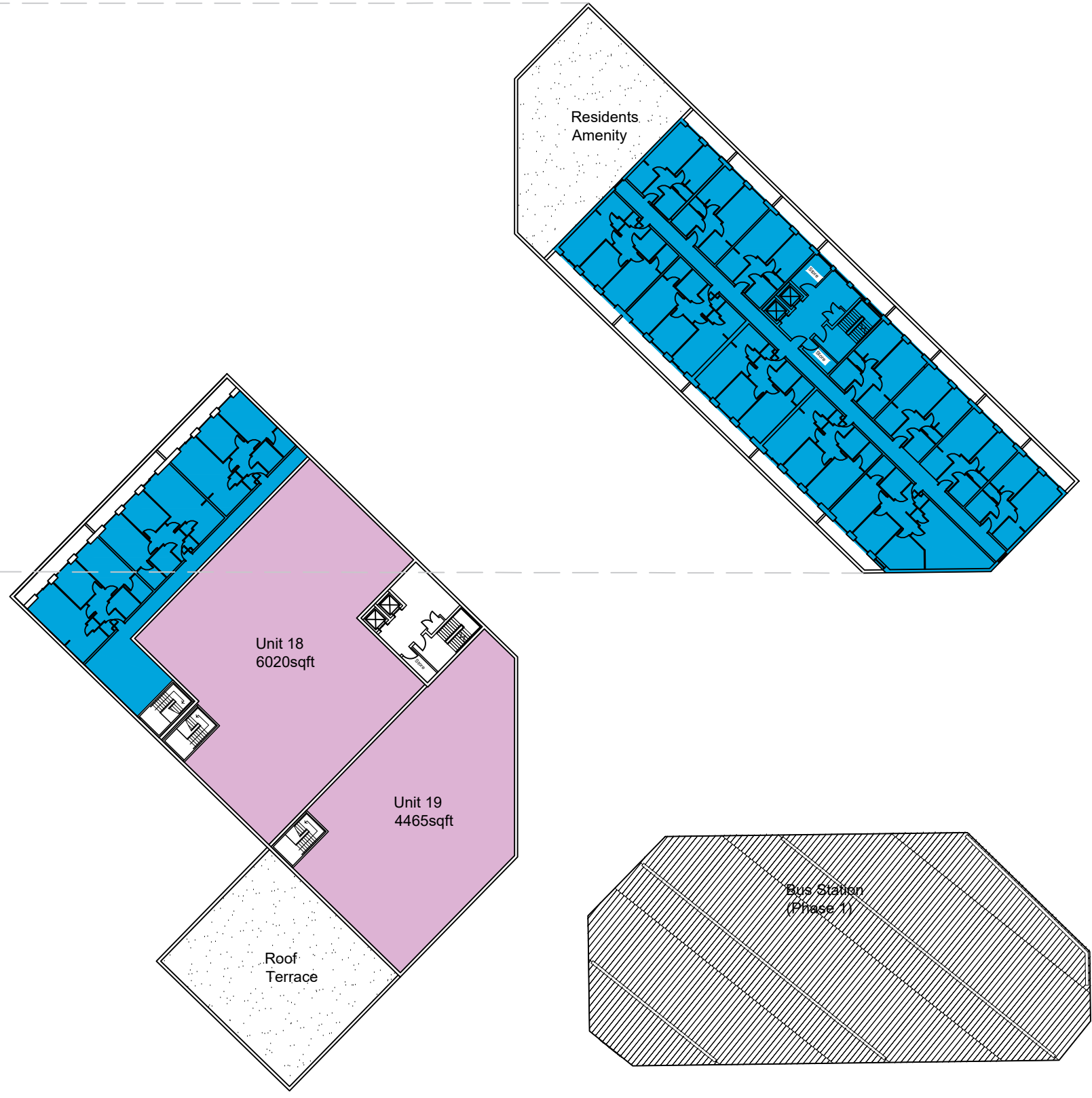
First Floor Level 1:500