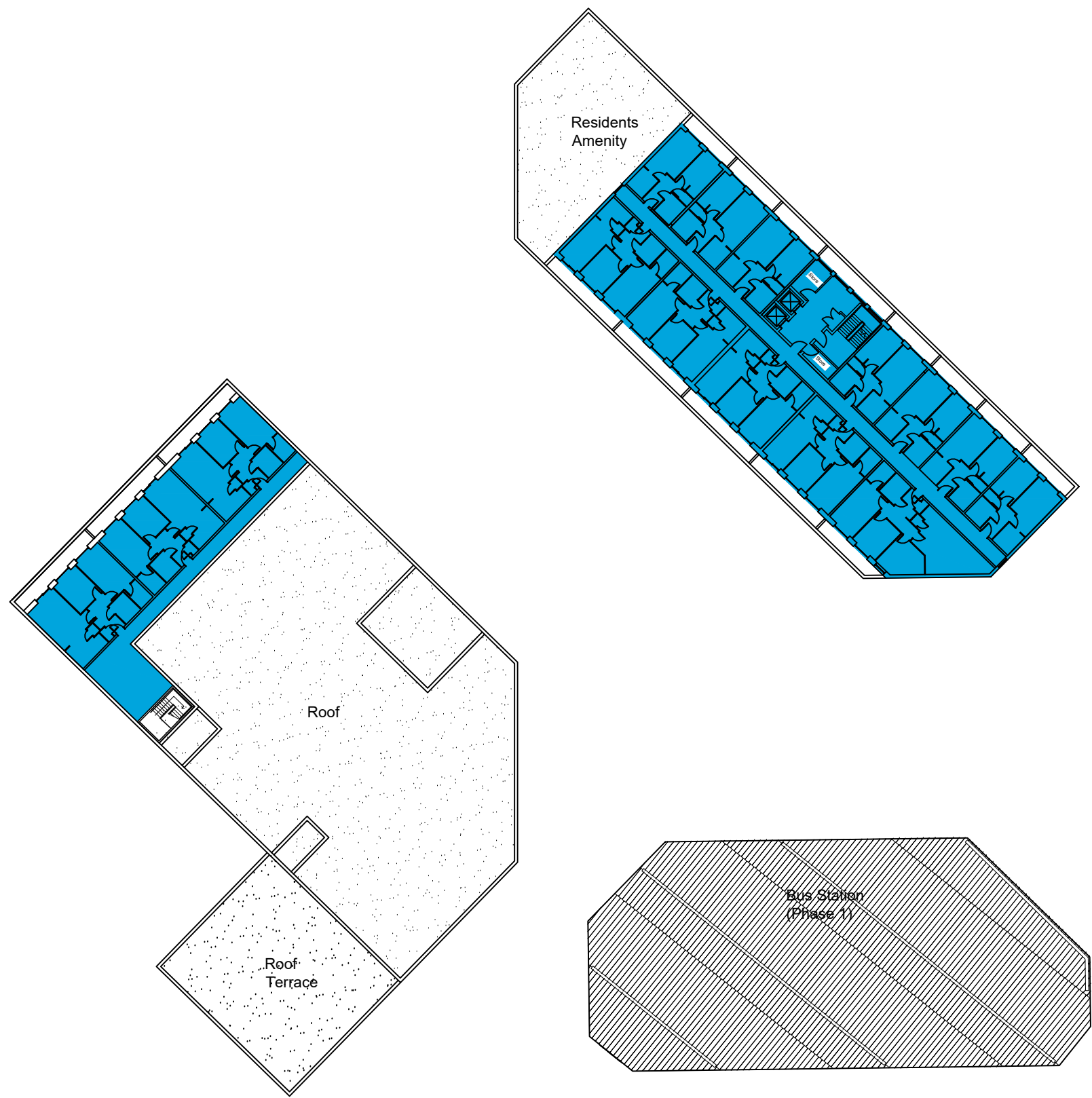
Second Floor Level 1:500